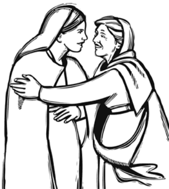
Mary Visits Elizabeth

Copyright © Sermons4Kids, Inc. May be reproduced for Ministry Use